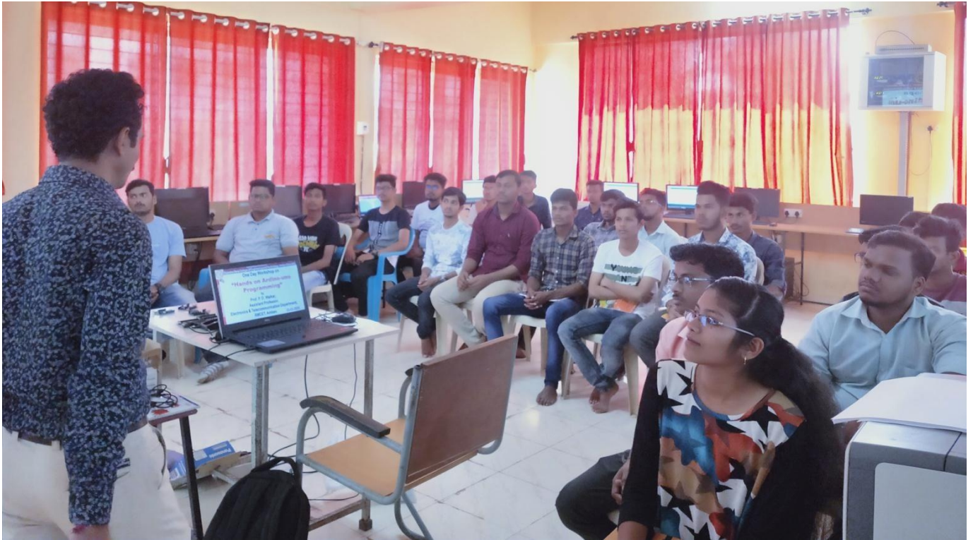
(Students participants during the ws)